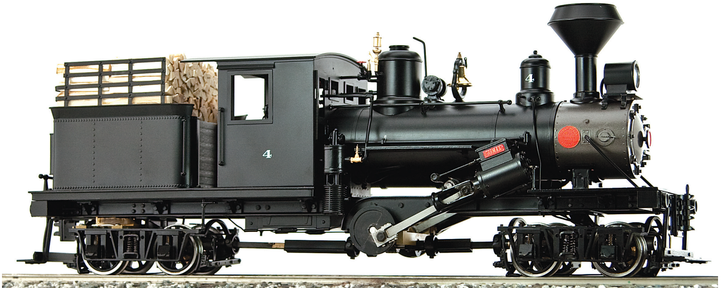
AC78-632 Climax Mich. Cal. #4, Electric