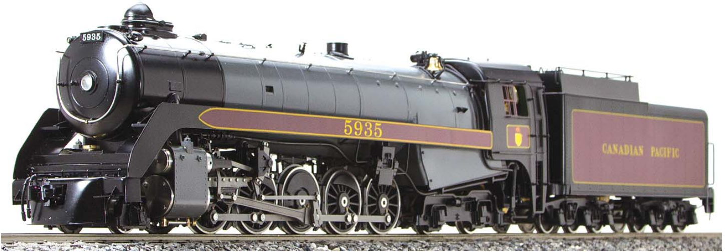
AL97-090 CP SELKIRK #5935

Accucraft's "Selkirk" #5935 represents the last T-1c class 2-10-4 built. Constructed by Montreal Locomotive Works in February/March 1949 as CP 5930-5935, these six oil burning T-1c class locos remained in service less than 10 years; the railway was already replacing steam with diesels. The 1:1 scale CP #5935 is preserved and on display at Exporail, the Canadian Railway Museum in Saint-Constant, Québec.