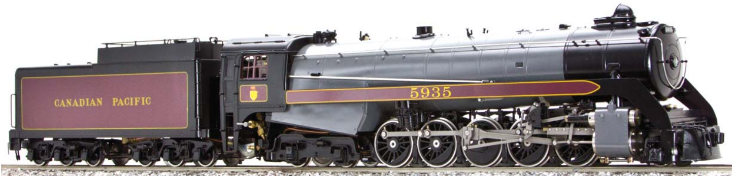
AL97-090 CP SELKIRK #5935